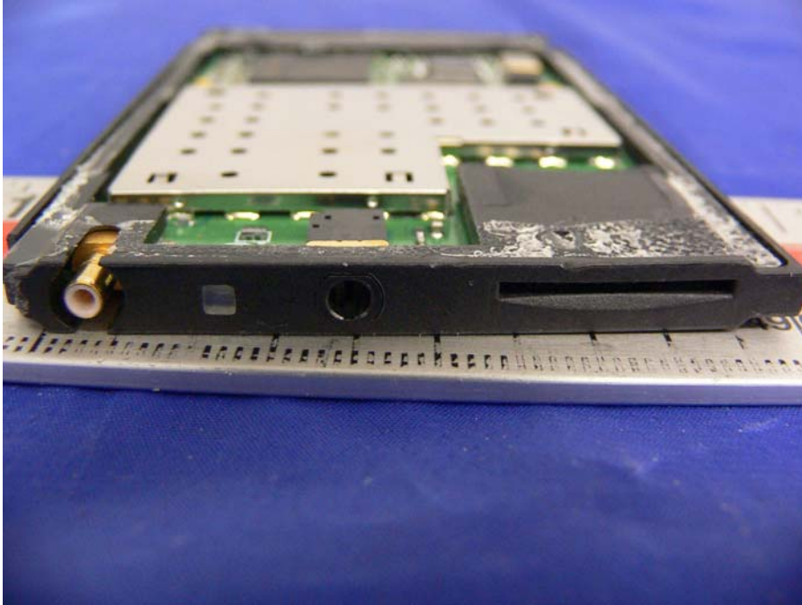
EUT – Component View with RF Shield off