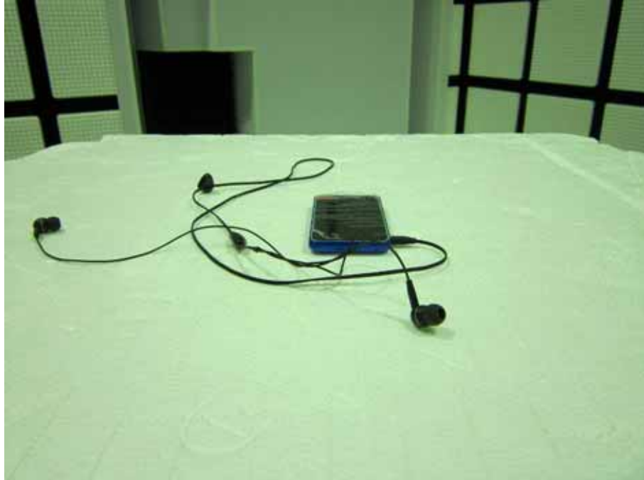
– X-axis –